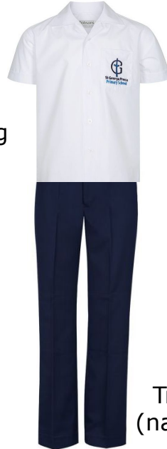
Trousers (navy only)