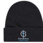
Winter Beanie - outdoors only not compulsory