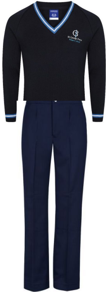
Pullover & Trousers (navy only)