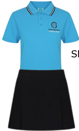
Short sleeve polo