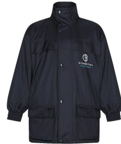
Jacket - outdoor use only