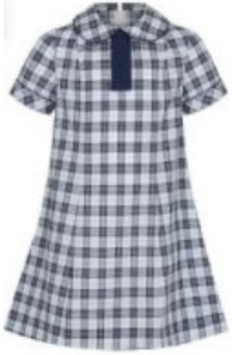
Summer dress (close to knee length)