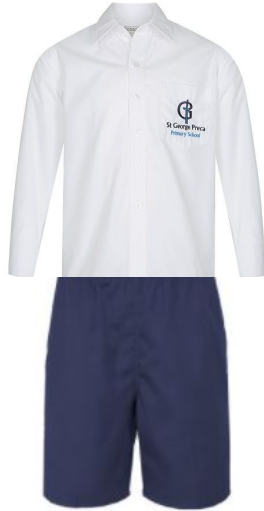
Academic shorts (navy only)