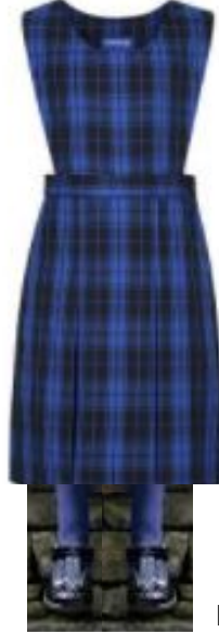
Only navy tights