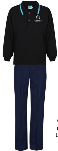
Rugby Jumper & Trousers (navy only)

At St George Preca, uniform is compulsory. We ask for your support in making sure students wear the correct uniform every day