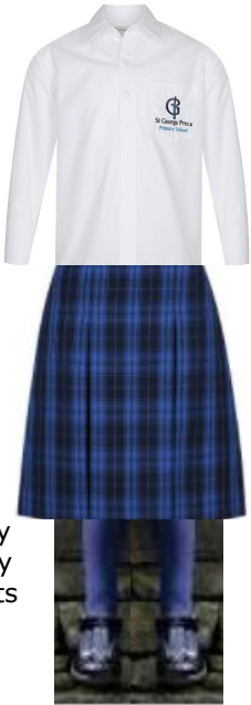
Only navy tights