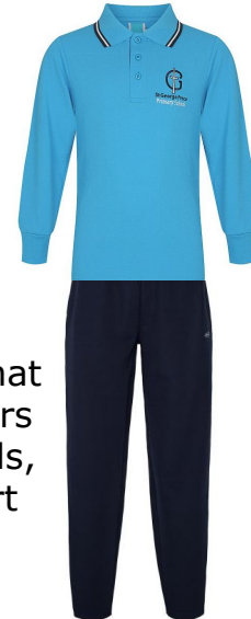
Long sleeve polo & tracksuit (navy only)