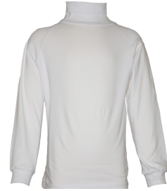
Skivvy w/Tunic Or Long sleeve w/Tunic