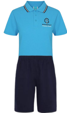
Microfibre or Jersey short (navy only)

REMEMBER TO PUT YOUR CHILD'S NAME ON ALL UNIFORM, HATS, LUNCH BOXES AND DRINK BOTTLES