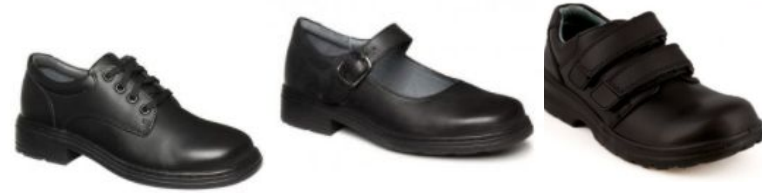
Black school shoes