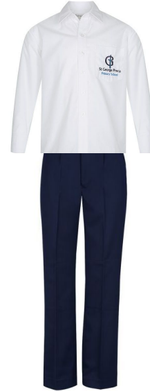
Long Sleeve Shirt & Trousers (navy only)