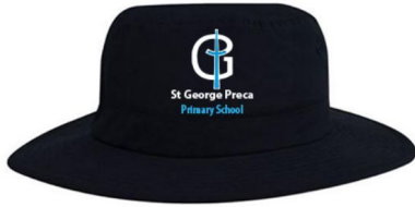
Summer Hat Compulsory in Term 1 & 4 Outdoor use only