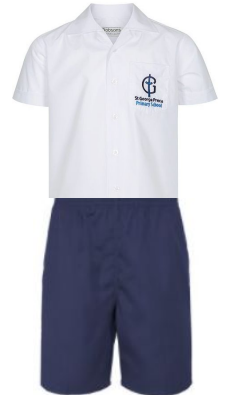
Academic Shorts & Short Sleeve Shirt

REMEMBER TO PUT YOUR CHILD'S NAME ON ALL UNIFORM, HATS, LUNCH BOXES AND DRINK BOTTLES