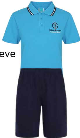
Microfibre or Jersey short (navy only)